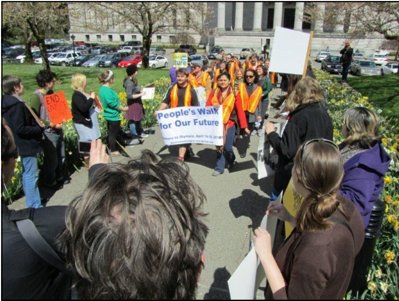
Entry into Olympia 50-mile Walk.

Thursday morning, April 14th, I joined a dozen people, walking from Seattle to Olympia to protest the cuts of billions of dollars that the Legislature intends to take away from health care, disability lifeline, housing, and education – while leaving untouched numerous unproductive tax loopholes that benefit wealthy interests, including corporations. We called it The People's Walk for Our Future .