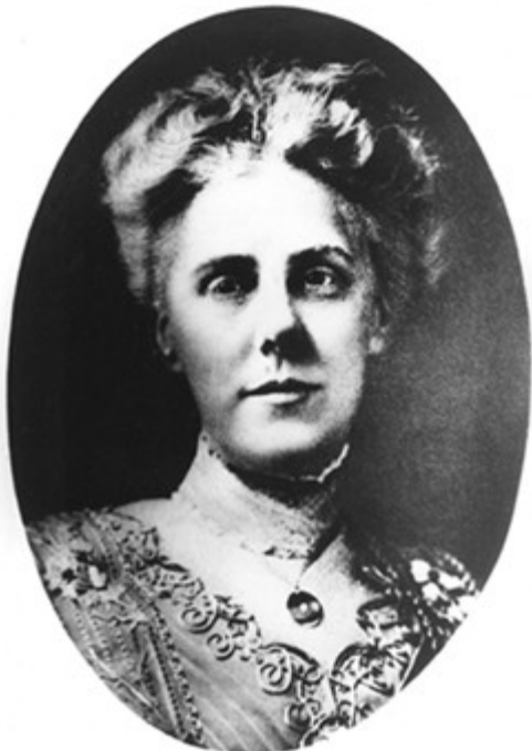
Anna Jarvis

Some clergy agree, objecting to the commercialism of the holiday. Does Mother's Day have religious meaning? If so what is it? Just consider the witness of its founder, Anna Jarvis.