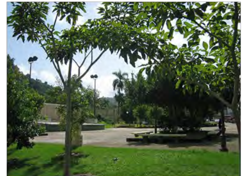
A view of the main plaza in Castañer, where the Fiesta de los Tres Reyes Magos takes place every January 6 th .

Some of my fondest memories are from the Festival of the Three Kings, which is celebrated on January 6 th of every year. During this time, in my home town, families got together at their grandparents’ homes and waited for the “three kings” to come by on their horses. As the procession went from one house to the next, people joined in, in their cars, or on horses or on foot. The whole town would process with the “three kings” to the baseball park – and later to the main plaza when this was finished – and join in the celebration. The kids would get presents from the “three kings” and food would be served. This was a community event, sponsored by the General Hospital of Castañer, my hometown.